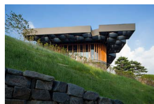
Taekwang Country Club House Gyeonggi-do, South Korea Size: 300 m 2 Year: 2014 - 2015