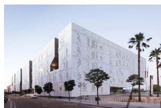
Palace of Justice, Cordoba, Spain Size: 48,000 m 2 Year: 2006 - 2017