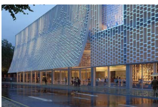
Macau Central Library, China Size: 15,000 m 2 Year: 2020 - 2025