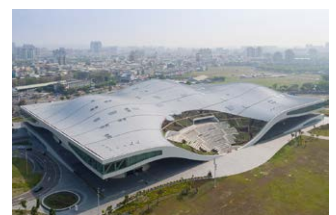
National Kaohsiung Centre for the Arts, Taiwan Size: 141,000 m 2 Year: 2007 - 2018