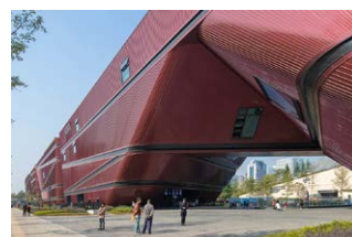
Longgang Cultural Centre, Shenzhen, China Size: 99,000 m 2 Year: 2012 - 2019