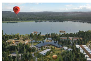
Senezh Management LAB, Solnechnogorsk, Russia Size: 50,000 m 2 Year: 2019 - 2021