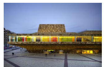
La Llotja Theatre and Conference Centre, Lleida, Spain Size: 37,500 m 2 Year: 2004 - 2010